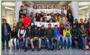
Sirius - Sochi, Russia - International Internships