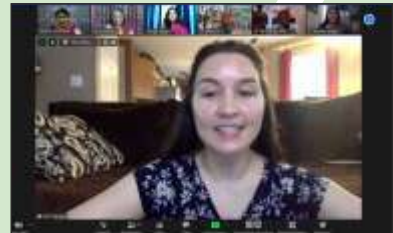
Virtual International Tours & Trips