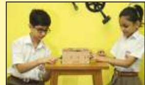
Innovation and Tinkering Labs