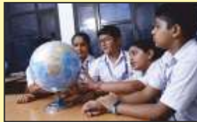
Social Emotional Learning