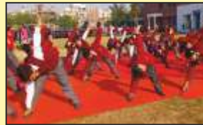
Health Education Curriculum