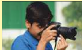
Financial Literacy & Media Literacy