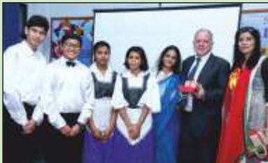
German Exchange Programme Through Max Muller