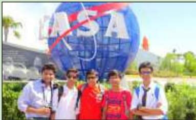
Visit to NASA

PROVIDING STUDENTS A GLOBAL EXPOSURE FOR A BROADER PERSPECTIVE