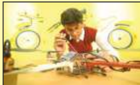
ICT Integration and Digital Immersion