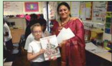
French Exchange Programme