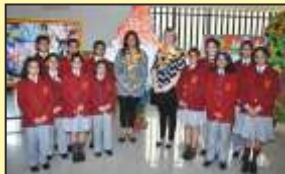
International Student Exchange Programme