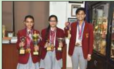
World Scholar Cup