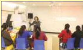
Teacher Training Academy