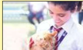
Happiness For Holistic Development