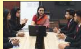
Career Development Programmes