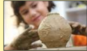
Culture of Art & Creativity